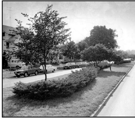
from the State Historical Society of Iowa, Iowa City, Project GREEN Collection.

Iowa Avenue's juniper plantings have declined through the years due to damage from accidents, diseases, or pests, and they soon will be replaced with Dense Yews ( Taxus media 'Densiformis'). The 'Densiformis' Yews will mature to a 36" height and can attain a width of 6 to 7 feet. The serpentine pattern of the evergreen beds in the median will be retained and the soil will be amended. The serpentine evergreen bed pattern has been a landscape element along Iowa Avenue since 1968. Included with this article is a photo showing the landscaping circa 1975