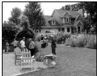
Garden of Holly Carver & Lain Adkins

Holly Carver and Lain Adkins knew from the start that they wanted to garden with native Iowa plants, and after very few years in their house they have thriving areas of grasses, blooming forbs, and magnificent