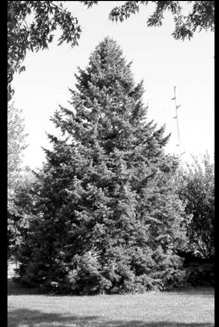
This Concolor Fir ( Abies concolor ), located within the landscaping at the northeast corner of Highway 6 and Gilbert Street, is obscured by overgrown and declining vegetation. Project GREEN plans to rejuvenate landscaping at this corner, which will expose views to this lovely specimen, next spring.