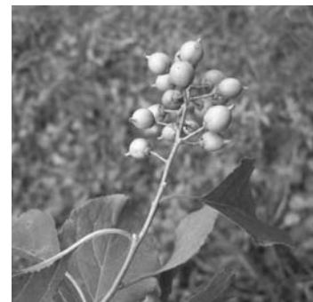
Fruit of American bittersweet is located only at the end of individual stems.