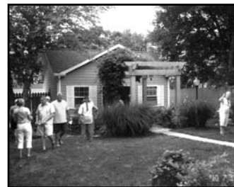
Garden of Michael Lensing

trumpet vines. Full sun in their yard not only provides the best possible conditions for plants that evolved in the tallgrass prairie, but it amplifies the bright colors and charming designs of both their garden's art and its seating areas. Visitors were intrigued by the way they've combined a productive vegetable garden, Holly's favorite zinnias, and broad meadowy areas that were just beginning to show their full midsummer glory.