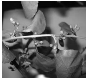
Flower clusters of Oriental bittersweet are located at the axils of individual leaves.