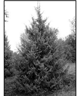
Top: Old Sargent Crabapple lost on Iowa Avenue. Bottom photos: Trees have flourished this year with all the rain.

areas throughout the season. One area along the east side of North Dubuque Street which is continually wet will be corrected when North Dubuque Street is improved. Meanwhile Rindy, Inc will address this weed problem with a weed-whacker.