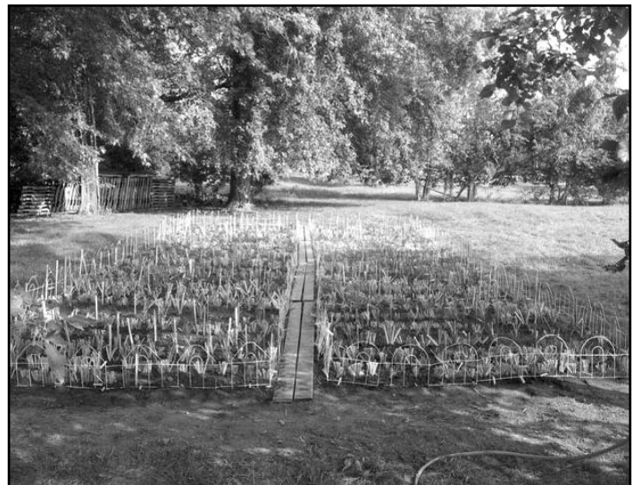
It's not a fairyland cemetery, but a slumber party for hostas! Members of the Shade Booth group lined out 1,510 hostas for a winter of rest before next spring's garden fair.