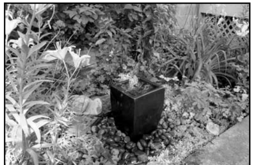
The Lions Club tour provided a glimpse of garden glory on Marcy Street.

and hosts would be disappointed; at the time we also expected road closures that might make Marcy Street inaccessible to many. Another possibility was overcrowding at the two gardens, making it difficult to appreciate the hard work that had gone into them. Parking and traffic were also major concerns, and substitute gardens are never easy to find, especially at the last minute. We were delighted to learn that the Marcy Street gardens found a place on the Lions Club tour held later in the month.