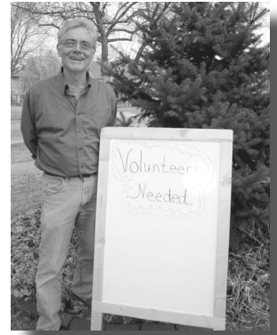
Watch for the sandwich board at the GREEN Garden Fair which will announce Project GREEN activities and events.